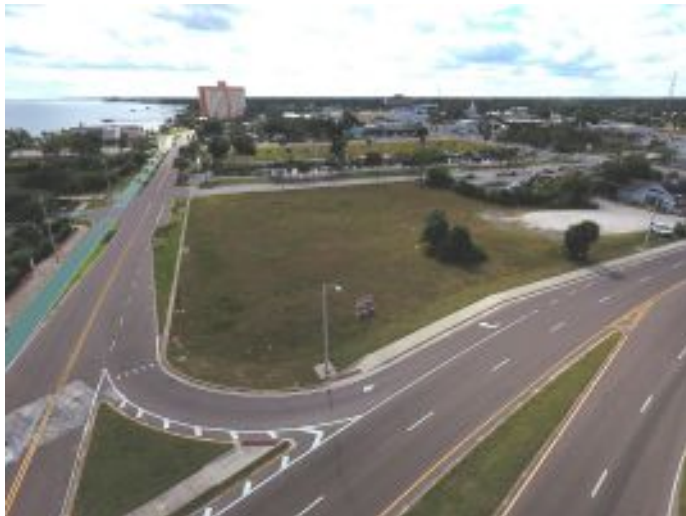
Site plans are under review for a 16,800-square-foot commercial plaza located at the southwest corner of Garden Street and Indian River Avenue. The project includes a retail store, restaurant and second floor open air tiki bar and observation deck .