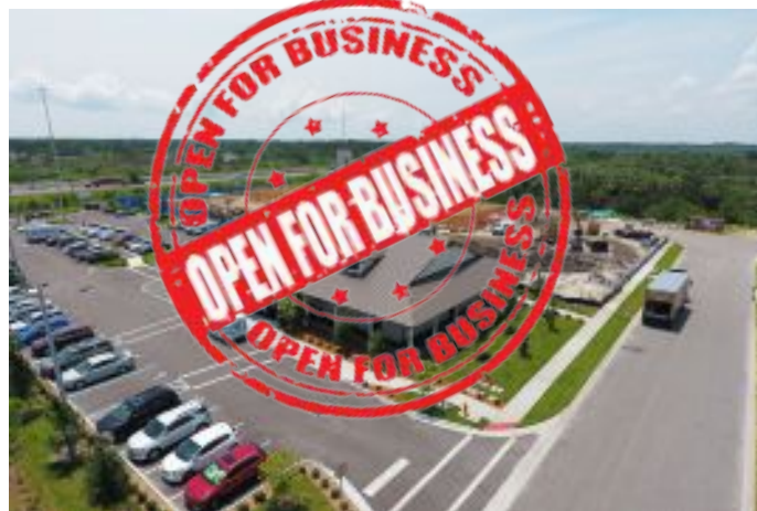
Construction is complete on the new Durango’s restaurant, which is open for business on Helen Houser Boulevard.