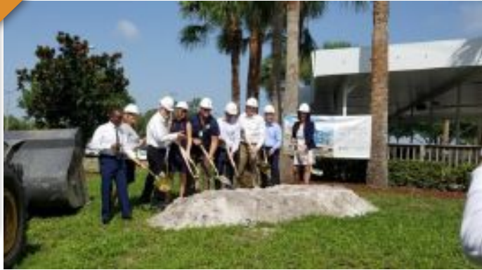
Site permits have been issued for a 152-room, five story hotel with an open deck on the roof located at 6225 Riverfront Center Boulevard.