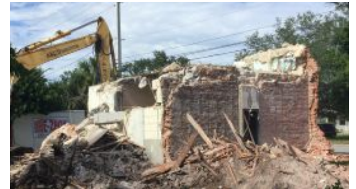
The old building at 313 Julia Street was recently purchased by Titusville Playhouse Inc. and demolished for future use. The building was constructed in 1901.