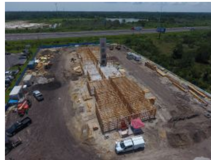
Construction continues on a 124-unit 4-story hotel located at the southern terminus of Helen Hauser Boulevard adjacent to the new Durango's restaurant.