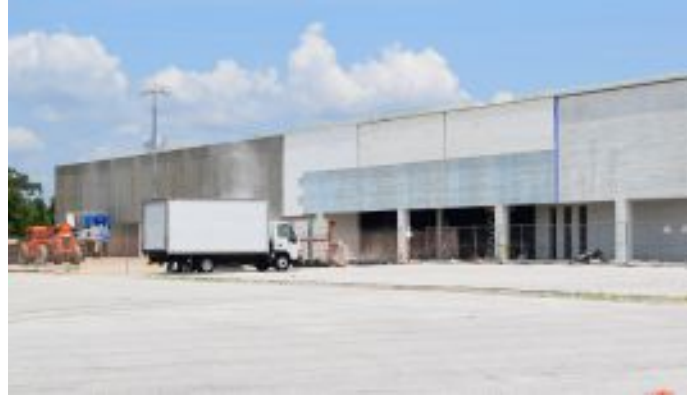
Site construction is underway to redevelop the former Kmart building into indoor, climate-controlled storage located at 810 Cheney Highway.