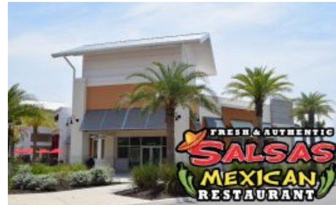
Interior buildout continues for a new restaurant at Titus Landing.