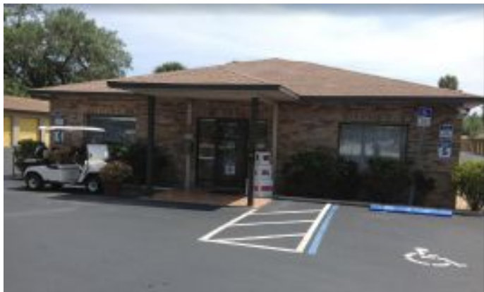
Site plans are under review for an expansion of the existing storage business located at 1903 Garden Street. The scope of work includes the demolition of two existing 1-story buildings and construction of one 3-story building consisting of indoor storage units.