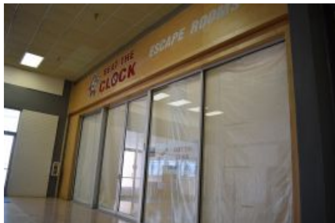
Construction is nearly complete on a new Escape Room business located at Titusville Mall, inside the former Hallmark store. Slated to open at the end of July, businesses and schools are already inquiring about field trips and team-building sessions they would like to plan at the attraction.