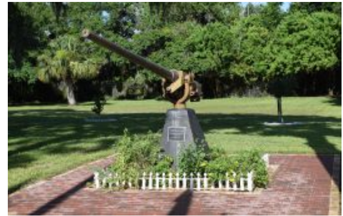
Veterans' headstones inside the cemetery. An old Naval cannon, donated by the Department of the Navy, has been restored to its former glory. Debris and overgrowth was cleared

Today, we are thrilled to announce that the work and upgrades on the cemetery are now complete! The cemetery grounds have been transformed with beautiful new landscaping and several other upgrades. An iron archway now adorns the entrance to the cemetery grounds, with new pavers marking a path to the central flag area, which has been upgraded with several new flags and flagpoles.