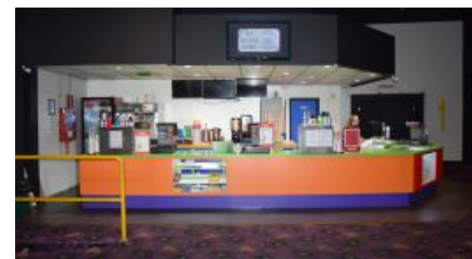
The front counter at Titusville Mall Cinema.

The Titusville Mall Cinema recently finished their renovation after Satellite Cinemas closed last year. The theater not only offers $5.00 movie tickets on second-run showings of current films, they are also ramping up video game tournaments and live stage shows. The two front theatres have been converted into stages for live performances like magic shows and big-band music concerts, and of the remaining theater rooms, four show films and the remaining rooms will be used for films or converted for game tournaments. One big hurdle during renovation has been replacing equipment as funds became available, because Satellite Cinema removed all of the projection systems when they left. The only thing remaining were two original film reel projectors that have been sitting upstairs for decades.