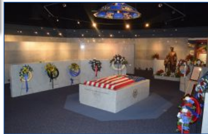
Above: The center of the Memorial inside the American Police Hall of Fame & Museum.

In the center of the room, an American Flag rests over a large marble block dedicated to unknown peace officers. This reverent display is encircled by flowers and wreaths, and is watched over by a bronze statue depicting a police officer with two small children, illustrating a police officer's connection to the community.