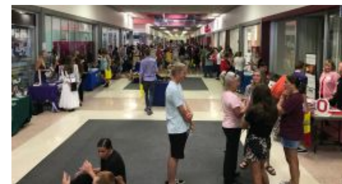
Locals gather for the annual Taste of Titusville, sponsored by Titusville Area Chamber Commerce.

Titusville Mall has positioned itself to be a versatile community centerpiece, able to support myriad events, and housing retail shopping, dining, and entertainment for everyone. Some of the events they host include collaborating with the Titusville Area Chamber of Commerce for the annual Taste of Titusville community event, the annual College Night for area high school students, and the election-year forum called Meet the Candidate.