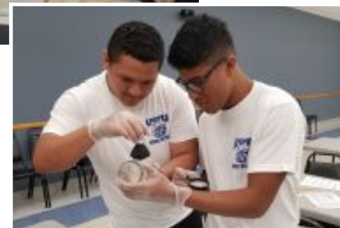
Right: Two students from Apopka High School practice dusting for fingerprints as part of a field trip.

This program enabled local children to learn about different career paths as they relate to Law Enforcement, Fire Rescue, and Space Exploration — apropos for us on the Space Coast. Throughout the camp, students toured the facilities of each organization, and learned with a