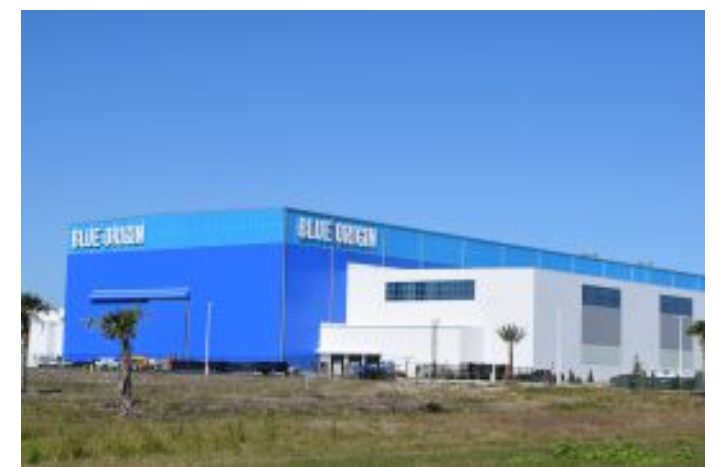
Building permits have been reviewed and issued for two new buildings on the Blue Origin campus. Steel-frame construction is underway on the 26,313-square-foot TCAT (Testing and Clearing Tanks associated with manufacturing rockets) building. The foundation is complete for a 71,710 -square-foot SCF (Surface Coating Facility) building.