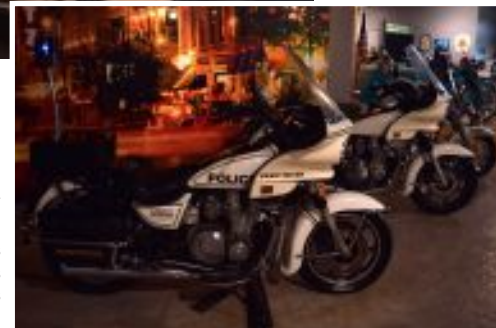
Right: The APHF also has a collection of police motorcycles and other vehicles used by departments across the country.

Also on display is a patrol car from Fort Worth, Texas that belonged to an officer killed in the line of duty; written on it are hundreds of signatures from members of that community who left messages of thanks and support in honor of the officer.