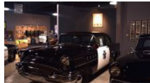
Left: Just one of the collection of vintage and contemporary police cars on display inside the APHF Museum.

The artifacts and exhibits on display include a large collection of firearms, which highlights the evolution of weapons used on both sides of the law. There are also different types of actual police vehicles and motorcycles ranging from early automobiles circa 1950s, to four-wheelers and jet skis used for off-road operations and drug interdiction.