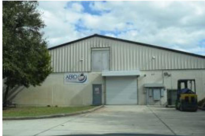
Site construction is underway for a 10,000-square-foot addition to the existing building located at 411 S. Park Avenue.