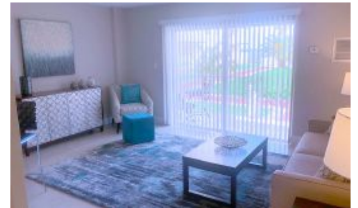
Construction and renovation continues on the DREAM Space Coast luxury apartment building on South Washington Avenue. Units are officially being leased at this time.