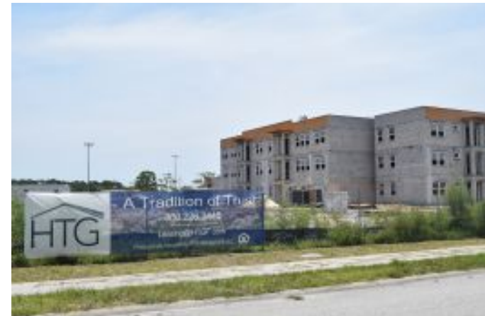
Site and building construction continues on an 84-unit, 3-story apartment complex located at the southeast corner of Sycamore Street and Deleon Avenue.