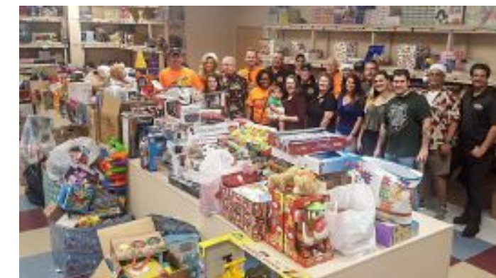
Workers prepare Christmas gifts for the children of fallen police officers as part of APHF's program to support families.

One of the lesser-known programs — but arguably the most important — is the support APHF provides to the families of disabled and fallen officers. Year after year, the organization serves the families of fallen and disabled officers, working to make their lives better and to show them love and appreciation for their sacrifice.