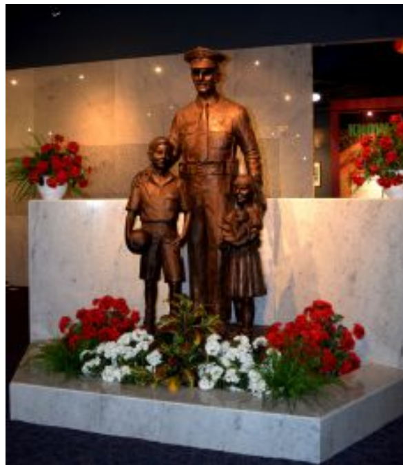
Below: The bronze statue depicting a police officer with young children.