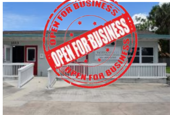
Modern Faces, a permanent makeup and esthetics business, is now open for business at 1115 South Washington Avenue.