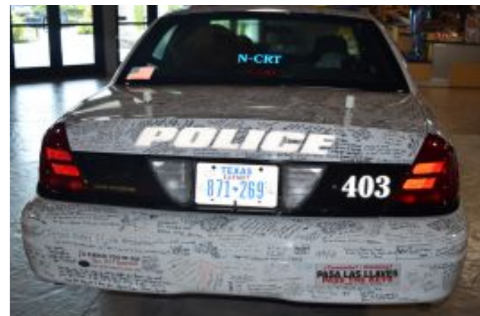
A Fort Worth, Texas police car covered with signatures and message from residents, honoring the fallen officer who used to drive it.

Also on display is a patrol car from Fort Worth, Texas that belonged to an officer killed in the line of duty; written on it are hundreds of signatures from members of that community who left messages of thanks and support in honor of the officer.