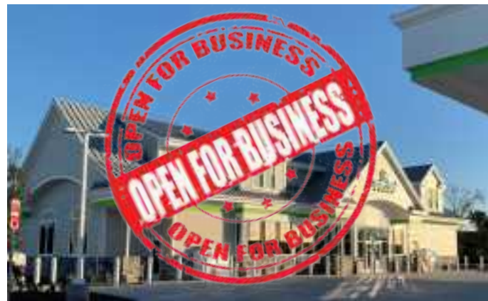
The new Cumberland Farms gas station and convenience store has opened at the new Titusville Point development at the corner of SR 405 and Cheney Highway.