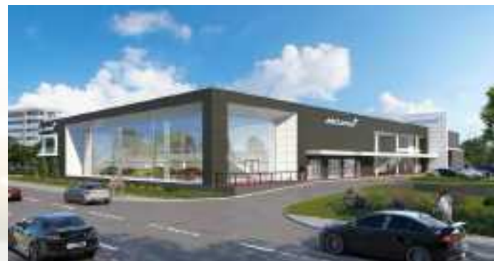
Design concept of McLaren Orlando's permanent home to be located in Winter Park, Florida.

The Titusville location is only temporary, however, as the company seeks to renovate the former Orchard Supply building located at 1111 Orlando Avenue, Winter Park. Just how temporary it will be is uncertain as the company continues to work with Winter Park's Planning and Zoning Board to approve their plans for redevelopment. Decisions on the project will be made by Winter Park City Council in mid-January.