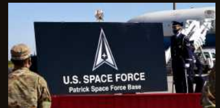
Patrick Space Force Base gets a new sign with its redesignation at a ceremony on Dec. 9, 2020.

The Department of the Air Force anticipates selecting the preferred location for U.S. Space Command Headquarters in early 2021. In the interim, Peterson AFB will remain the provisional location for U.S. Space Command Headquarters until a permanent location is selected and facilities are ready to support the mission. Regardless of the decision, our communities should be proud of the role we have played in support of our nation's space operations, and the role we will continue to play as Cape Canaveral Space Force Station and Patrick Space Force Space stay at the forefront of the final frontier.