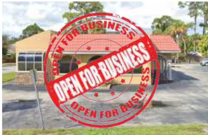
La Bella Vista Italian restaurant has opened at 3350 S. Washington Ave., the former location of Portofino's.