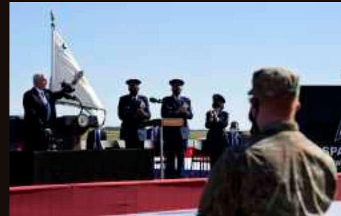
Vice President Mike Pence gives remarks at a ceremony for the renaming of two Department of the Air Force installations on Dec. 9, 2020, at Cape Canaveral Space Force Station, Fla.

The 45th Space Wing is the military command responsible for all government and commercial space launches on the east coast of the U.S., and was officially designated in 1991. Its history, however, dates back to 1949 when it was known as the Air Force Division, Joint Long-Range Proving Ground. Despite the ceremony, Space Force officials emphasized that until final decisions are made relating to Space Force installations, and official transfers