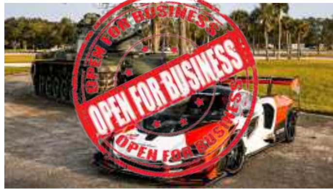
McLaren of Orlando opened a showroom for their luxury sports cars at the Knight's Armament facility at 701 Columbia Blvd.