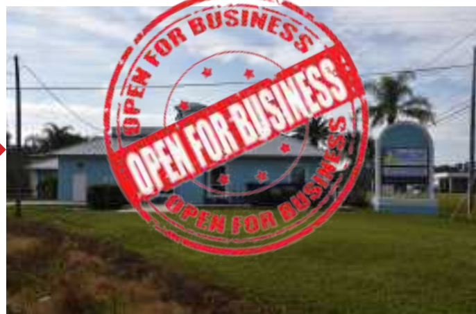
Barlow Orthodontics has completed renovation of 4987 South Washington Avenue. The building will be their new Titusville office starting on Wednesday, January 13, 2021.