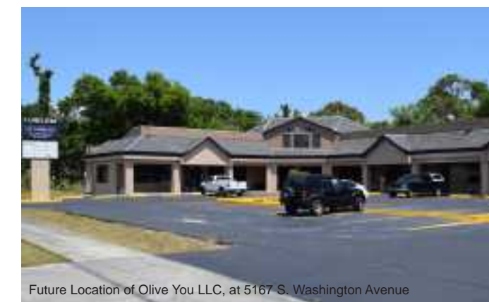
Future Location of Olive You LLC, at 5167 S. Washington Avenue

“We can’t wait to meet you!” To learn more about the unique olive and vinegar blends and tasting opportunities, head over to oliveyoutastings.com or call (321) 225-4766.