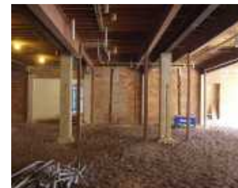
Instead, they were placed a few feet away, causing the floors to bow and sag over the years as more and more weight was added by continuous changes over the years. This resulted in the contractor having to add several new steel beams to the structure in order to maintain integrity and safety for the upper floors.

One key issue the contractors faced involved the second and third-floor load bearing beams not being correctly placed above the main first floor support beam when the building was constructed in 1924.