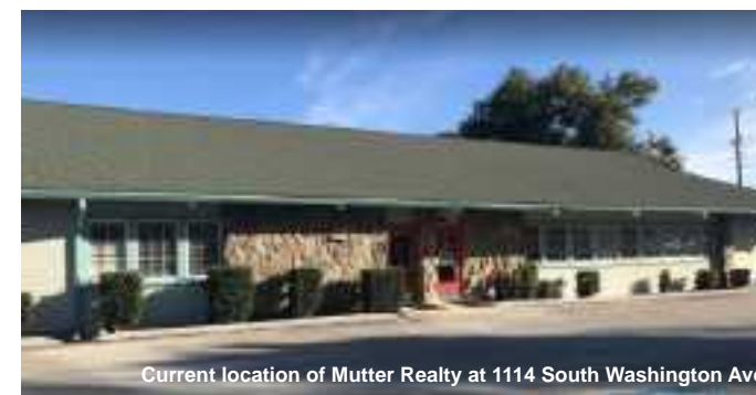
Current location of Mutter Realty at 1114 South Washington Ave.

Mutter Real Estate Group is a full-service real estate brokerage, handling residential, commercial, sales and leasing, property management, relocation and all distressed sales. They are family owned and operated.