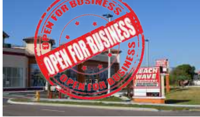
Beachwave opened their doors in January 2020, providing a plethora of beach attire, swimming accoutrement and more.