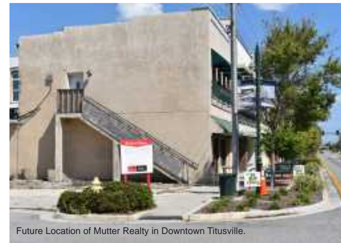
Future Location of Mutter Realty in Downtown Titusville.

Mutter Real Estate Group is a full-service real estate brokerage, handling residential, commercial, sales and leasing, property management, relocation and all distressed sales. They are family owned and operated.