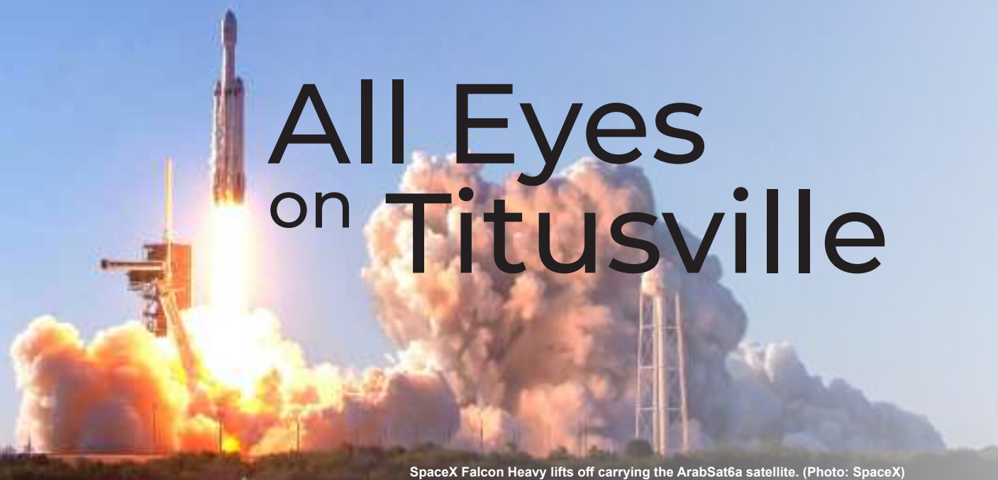
SpaceX Falcon Heavy lifts off carrying the ArabSat6a satellite.