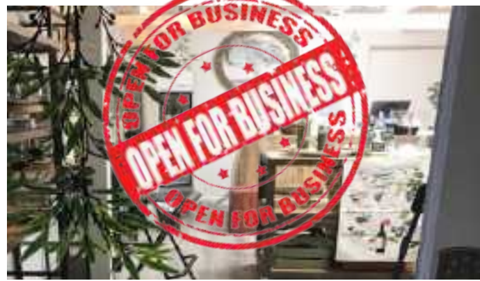
Olive You, a new specialty shop featuring various olive oils and balsamic vinegars, is open at 11 Main Street in Downtown Titusville.