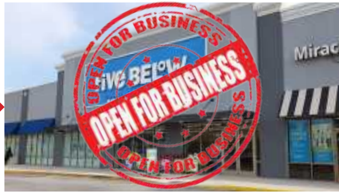
A new Five Below store has opened inside the Target Plaza on Columbia Boulevard.