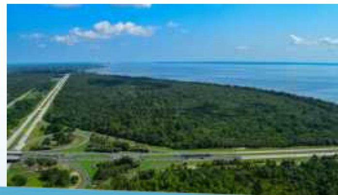
This 250-acre tract of land will one day be the luxury development known as The Shores at Tranquility.

While these properties offer the typical fare for an upscale waterfront