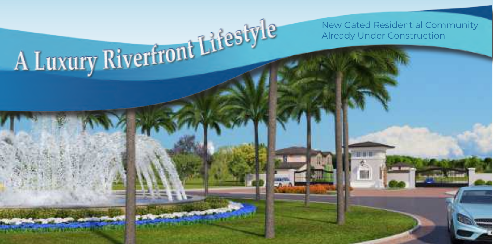
Artist rendering showing the private entrance into the gated community.

T he Shores at Tranquility is a brand new, private, gated residential community located on pristine and previously undeveloped land along Florida's Space Coast. Phase I of this beautiful community includes just 97 waterfront home sites – 62 of those lots with direct Intracoastal frontage.