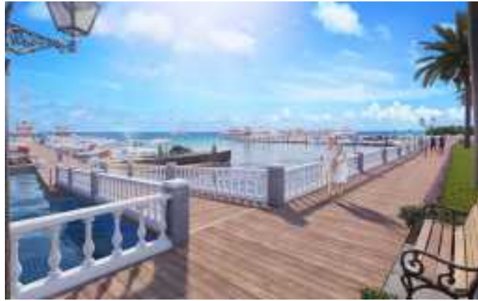
Concept of a marina which may be included in the final design of the community.