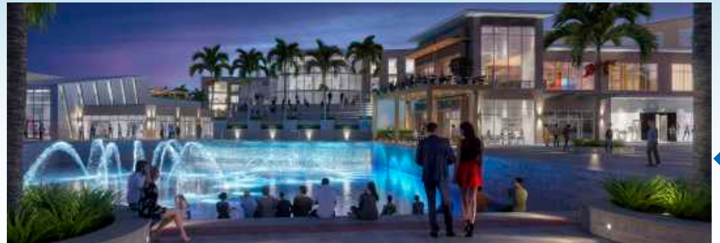
Artist rendering showing the conceptual commercial town center that may be part of the final community.

"This will be a destination to visit, a place to hang out with neighbors and family."