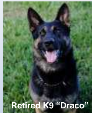
Retired K9 "Draco"

K9 Titan and K9 Astro are both Belgian Malinois and just over a year old. They are currently completing their 600-plus hours of initial training, and will be working with the patrol division in a few months. In fact, Titan and Astro will be the first certified Explosive Ordinance Detection (EOD) K9s in the history of our agency, and are among a select few within Brevard County.