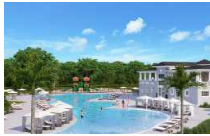
Design concept of the community club house, featuring a playground and pool.

In addition to these activities, the community will feature a mixed-use town center.