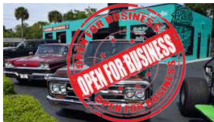
A new automotive customization shop has opened at 701 South Washington Avenue.