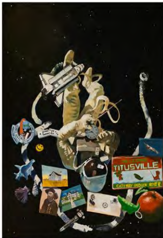
'Space and Time Capsule' Limited Edition of 50

The pictures I took do not do justice to the mastery of the artist and beauty of this work of art!