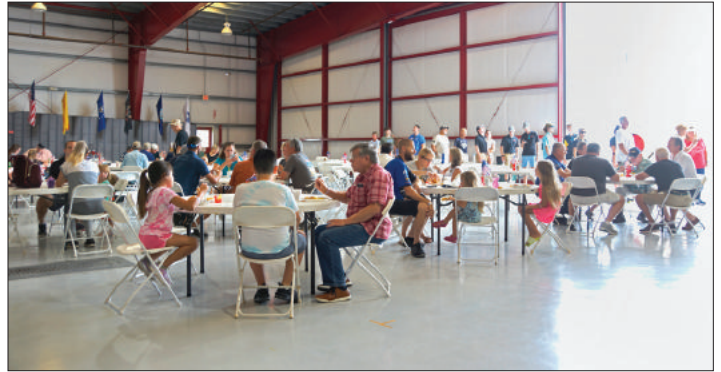
The guests enjoying the food and camaraderie