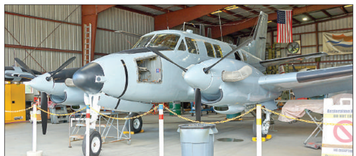
RU-21a UTE almost ready for display