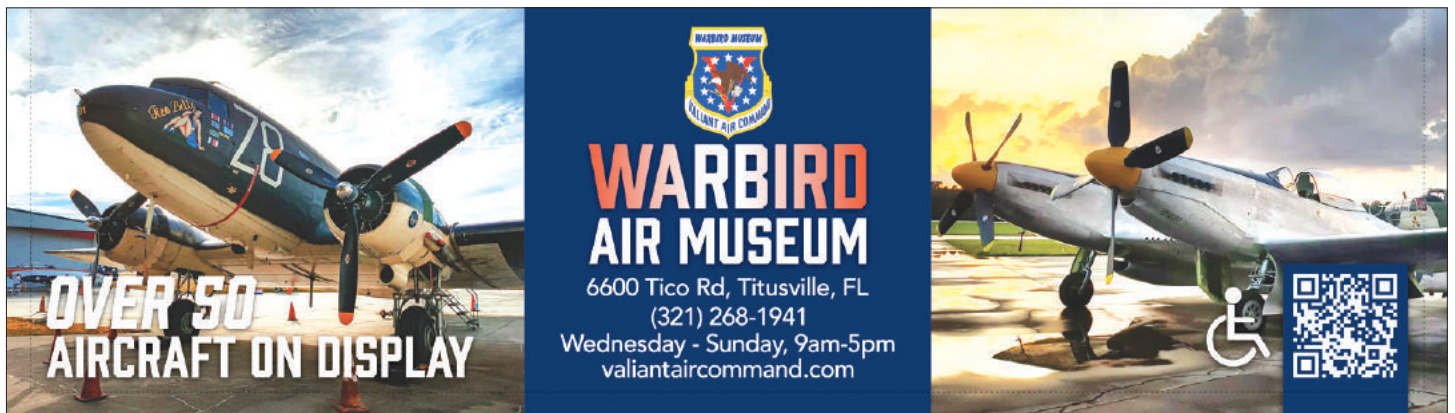
Our ad at the international baggage claim at Melbourne Airport