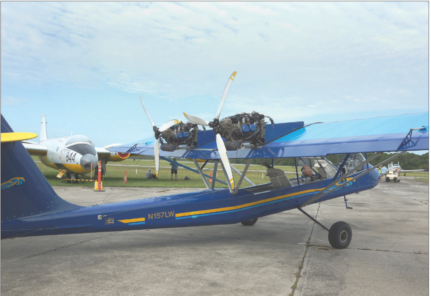
One of the more unusual arrivals

Fly-in/Drive-in breakfast - August 13, 2022 - Largest attendance to-date