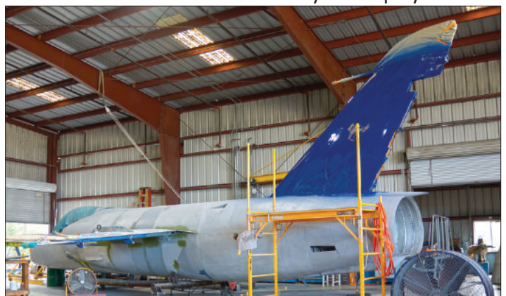
F11F-1 being restored to be displayed at the Samuel Oschin Air and Space Center Museum in California