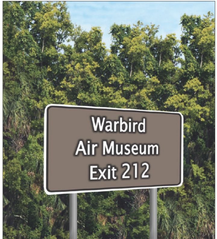
VAC sign on I-95

We doubled the area where our rack cards are distributed with our vendor FPIS. Our rack cards will now be distributed throughout all of Brevard County.