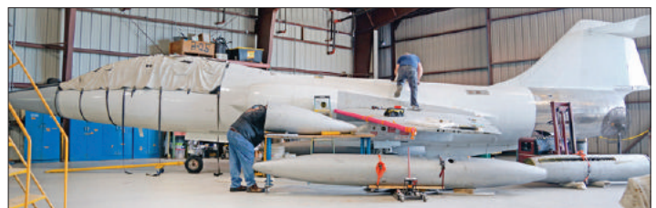
F-104 Starfighter in the restoration hangar

A private family service was held at Riverside Gordon Memorial Chapel, N. Miami Beach, Florida.