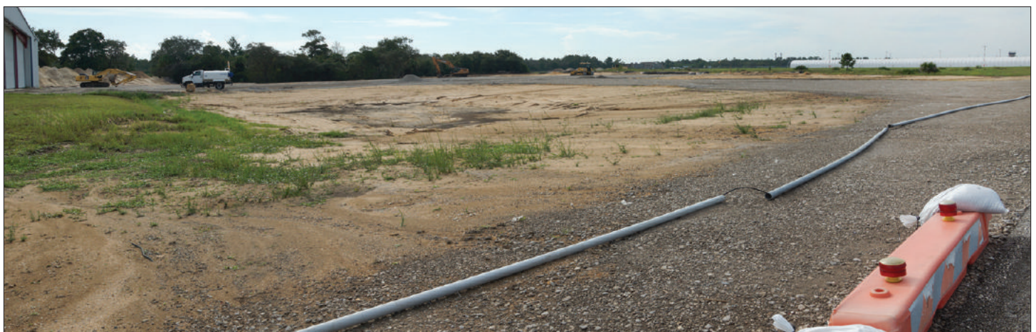
September 10, 2022 - Phase 2 progress report - Base for the asphalt is nearing completion