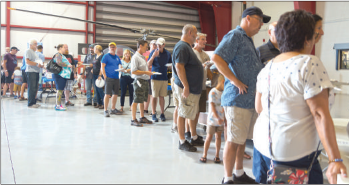
Long lines caused by the largest attendance ever