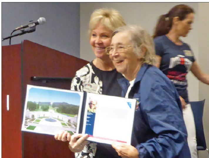
Military Women's Memorial

The second stop was at the National World War II Memorial, where Congressman Bill Posey, U.S. representative for Florida's 8th congressional district, gave a welcoming speech and a group photo was taken. This memorial is huge, and there was much to see. Due to time constraints, it was impossible to see everything, but we were given more details to read in our backpacks. Thirdly, it was a short walk to the Korean War Veterans Memorial, where we posed for another group photo. I was eager to see this memorial after seeing the videos of previous Honor Flights.