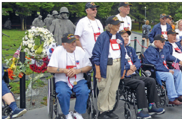
Korean War Veterans Memorial

Back on the bus, we ate a box lunch and were driven to The Tomb of the Unknown Soldier where we all were required to be in wheelchairs. We were escorted silently to a roped-off area in the front. While there, we watched the changing of the guard, and it was explained to us that as the guard passed us and slightly scuffed his shoes, he was giving us a silent salute of honor for our service. We were honored to view two wreath presentations, a school group, and our Honor Flight wreath.