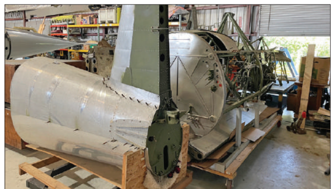
BT-13 as shipped - hard to believe this will be a plane