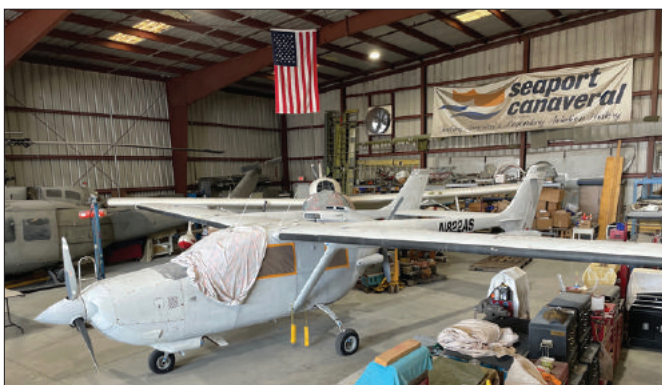
Cessna 337 in restoration

Since the last newsletter, we have received two aircraft for our museum, Cessna 337 H and a BT-13. The Air Force 02 A and B model, Vietnam FAC aircraft, is a Cessna 337. The Cessna 337 H that we received has served in many covert operations in many countries with a fleet of other 337 H's, most have very little knowledge of its mission profile. More information will be forthcoming. The BT-13 was built in 1942 as a training aircraft for the U.S. Army Air Forces. Research will be done to get its past history.