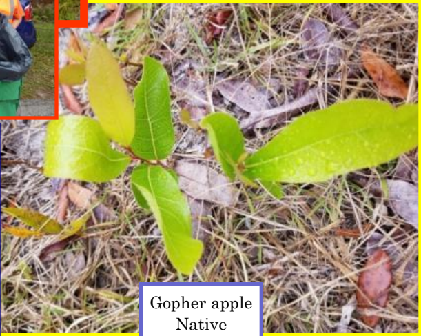
Gopher apple Native