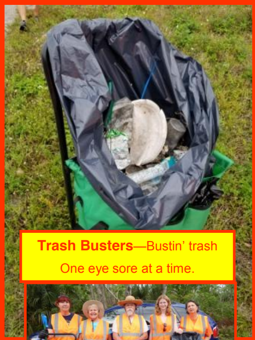
Trash Busters—Bustin' trash One eye sore at a time.