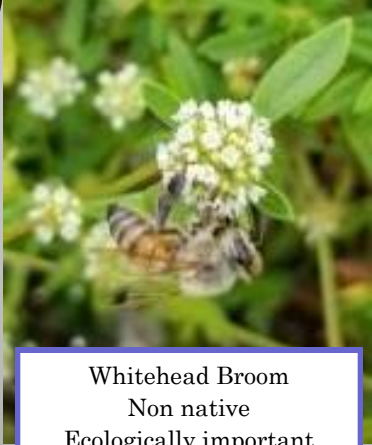
Whitehead Broom Non native Ecologically important

Is it a Public Service? Is it a Good Neighbor Activity? Is it a nature hike? It is all of those and more. Walk along Columbia Blvd (SR405) with naturalists, botanists, and native plant enthusiast for fun, fellowship, education, and exercise, all the while helping to keep Brevard trash free.