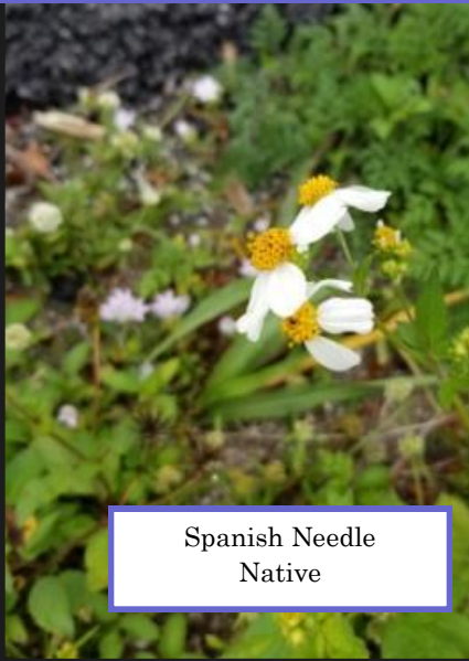
Spanish Needle Native

Is it a Public Service? Is it a Good Neighbor Activity? Is it a nature hike? It is all of those and more. Walk along Columbia Blvd (SR405) with naturalists, botanists, and native plant enthusiast for fun, fellowship, education, and exercise, all the while helping to keep Brevard trash free.