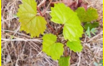
Muscadine grape Native