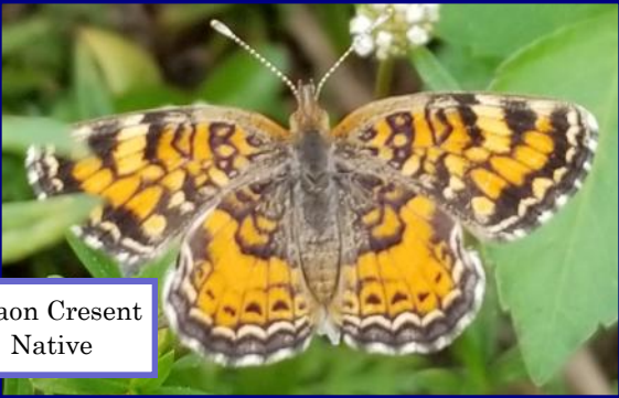
Phaon Crescent Native